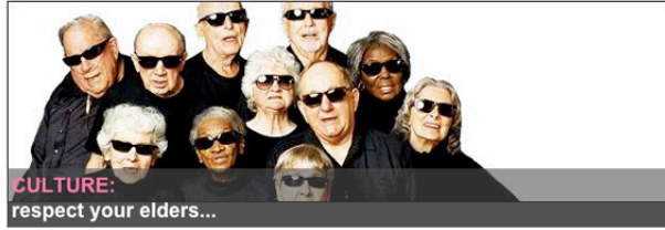
CULTURE: respect your elders...